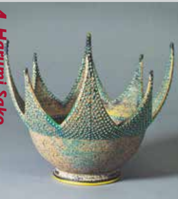
4 Harumi Sako