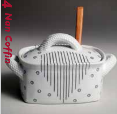
4 Nan Coffin