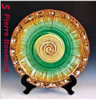
5 Pierre Bonnaud