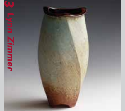
3 Lynn Zimmer