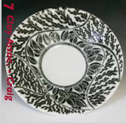
7 Clay Assbe - Craig