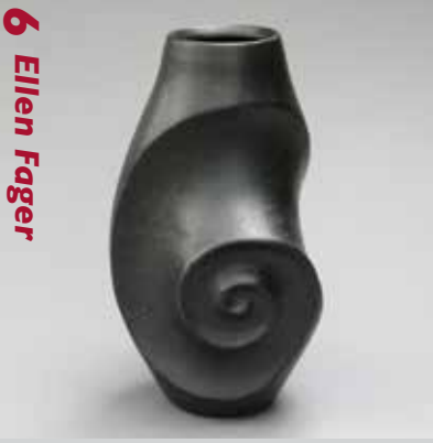
6 Ellen Fager