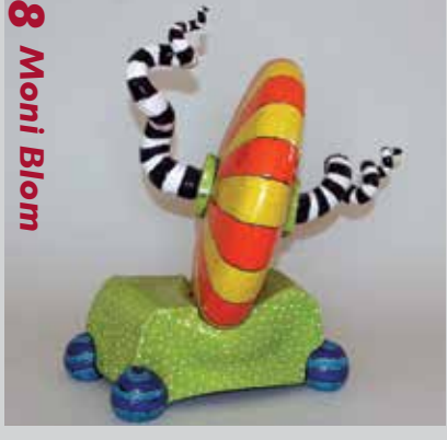
8 Moni Blom