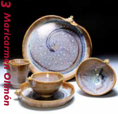
3 Maricarmen Olmón