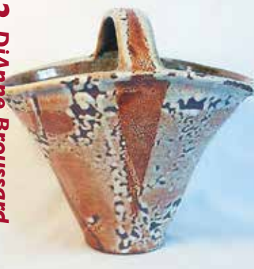
2 Dianne Broussard