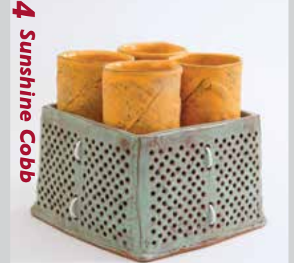
4 Sunshine Cobb