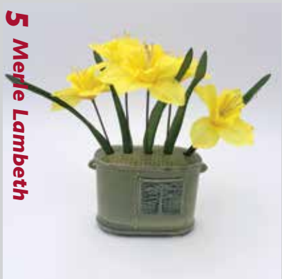
5 Mele Lambeth