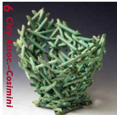
6 Clay Assoc.--Cosimini