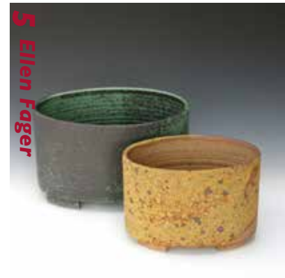
5 Ellen Fager