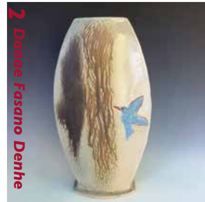
2 Danne Fasano Denhe