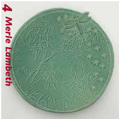
4 Merle Lambeth