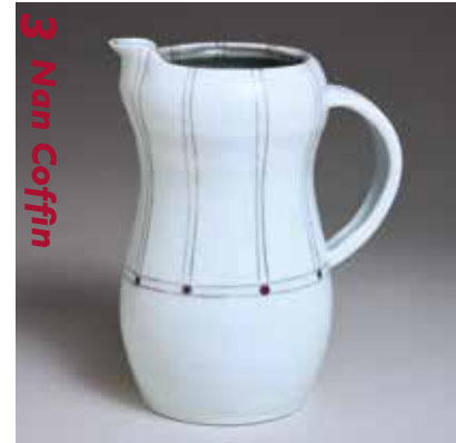
3 Nan Coffin