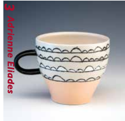
3 Adrienne Eliades