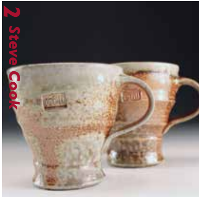
2 Steve Cook