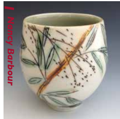
1 Nancy Barbour