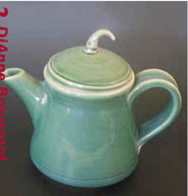
2 Dianne Broussard