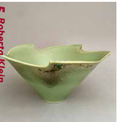
5 Roberta Klein