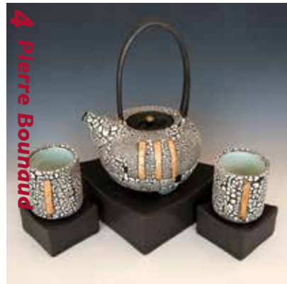
4 Pierre Bounaud