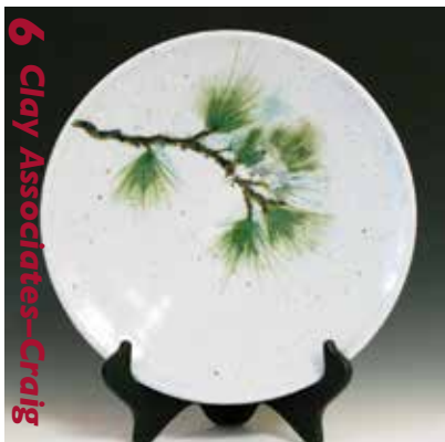
6 Clay Associates--Craig