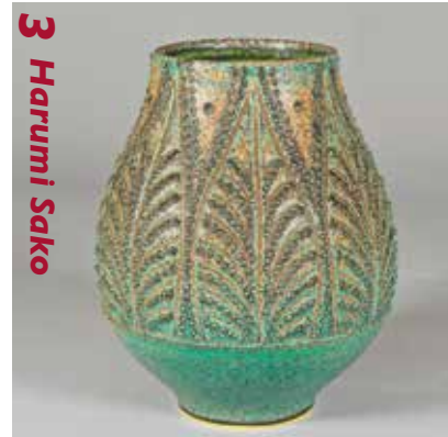
3 Harumi Sako