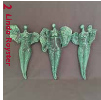
2 Linda Royster