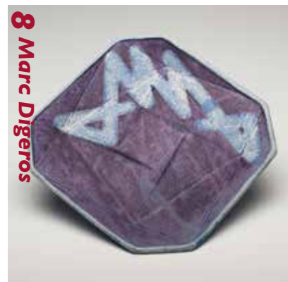
8 Marc Digeros